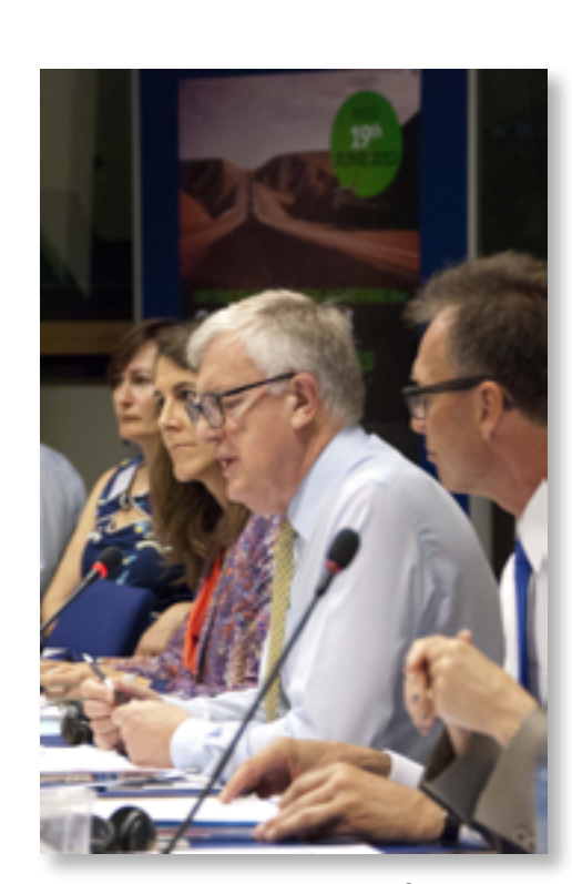
Plenary Session 1

This year's event was particularly As stated by the European Comimportant as it marked the first mission, customers can play an essential part in shaping EU energy policy; and customers who are informed, engaged and