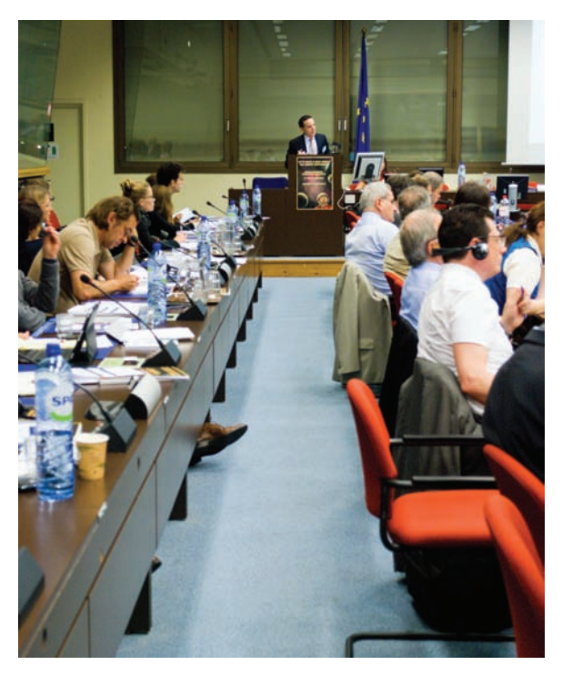
Testimonial by consumer body at the CEER Customer Conference.

In addition to the CEER 2012 Annual Conference (25th January) on energy infrastructure and energy efficiency and our Customer Conference (21st June), CEER held 6 public workshops including a joint event with ICER on renewables during Sustainable Energy Week, 2 joint events with ACER, and a joint event with EURELECTRIC and the Energy Community Regulatory Board (ECRB) on voltage quality. Participation in all our events is free of charge. A number of our public events were web-streamed live. Videos, presentations and participant lists are available on our website. Feedback forms are circulated at all our events and we act on the lessons learned.