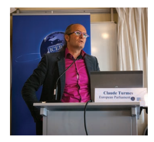
Claude Turmes MEP, at the CEER-ICER workshop on renewables, June 2012