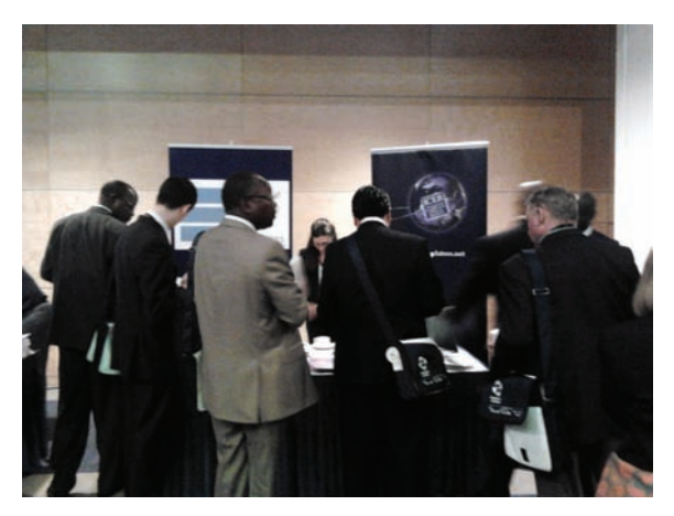
CEER-ICER stand at WFER V, Quebec