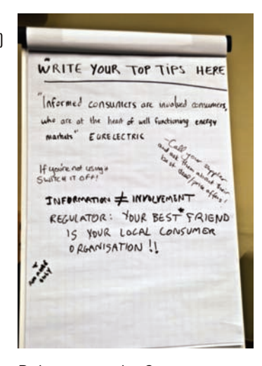
Delegates at the Customer Conference were invited to write their Top Tips

consumer issues with the Energy Community Regulatory Board (ECRB) in 2013 and through its continued involvement at global level in ICER's customer work.