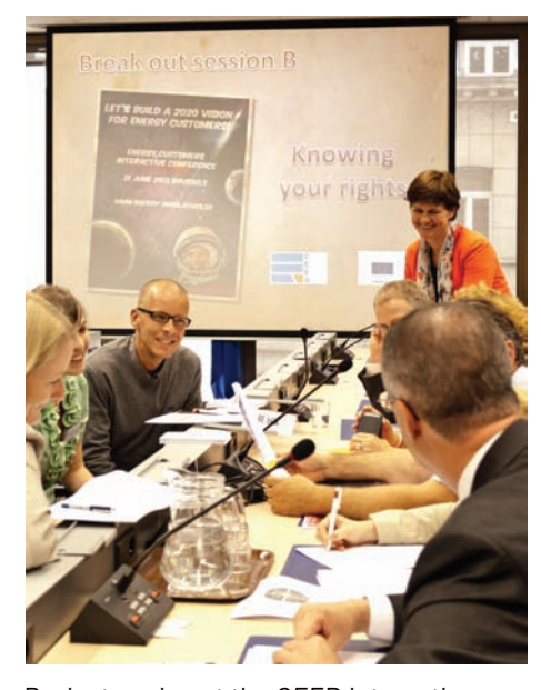
Brainstorming at the CEER interactive Customer Conference

We held two workshops on customer topics and a Customer Conference. The Customer Conference was the "Talk of the Town" in Brussels during Sustainable Energy Week, in June 2012. With 37 representatives from national consumer bodies attending this truly interactive event, we succeeded in engaging consumer bodies in the process of drafting a 2020 customer vision.