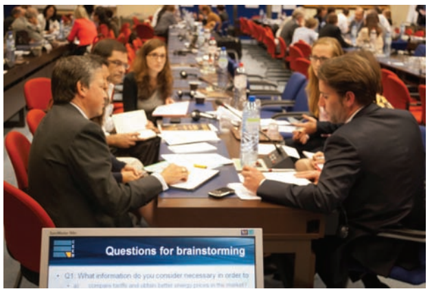
Breakout session at our interactive Customer Conference

CEER not only plays a central role in the substantive issues being discussed at the fora but we also take much away from the fora in listening to stakeholders' concerns.