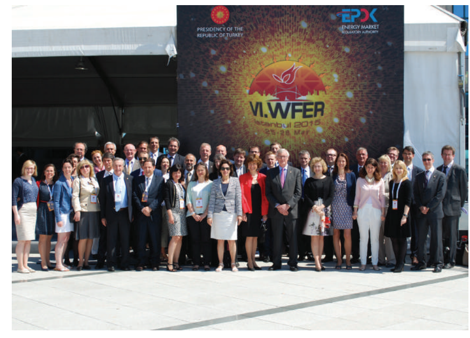
CEER delegation at WFER6, Istanbul