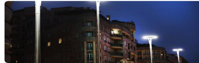
EU4Energy - Promoting the Clean Energy Transition - Empowering Consumers through Better Regulation Project Description